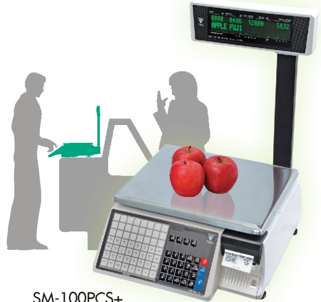
SM-100PCS+ 56 Preset Keys